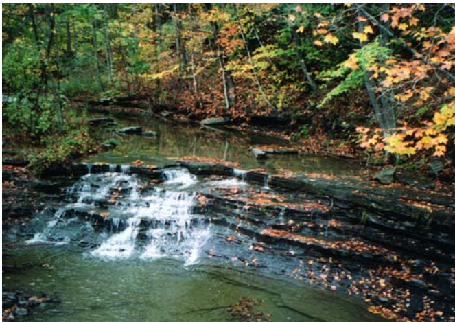
The Schoharie Creek Preserve

Because so many areas of the Mohawk Valley cry out for preservation, the Conservancy has expanded its vision, committing to operate in a broad target area that extends beyond the boundaries of Albany County. ACLC already owns the Schoharie Creek Preserve, and is working on additional projects in Montgomery and Schenectady Counties. To oversee the development and management of current and future ACLC resources in areas of the valley not served by other land trusts, the Board has recently established a Mohawk Valley Committee. Initially it will focus on western Schenectady and eastern Montgomery Counties, where development pressure is strongest. Neighborhood Committees have already begun developing management and work plans for the Schoharie Creek preserve in Burtonsville and a future preserve in Amsterdam.