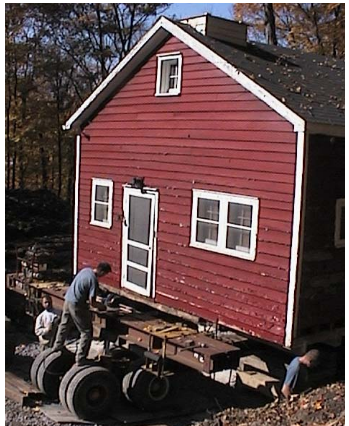
Moving up day

Once the Conservancy repairs the inside of the school, it will be open to visitors. In the meantime, if you happen to drive along Route 32, you will see the one-room schoolhouse overlooking the historic Onesquethaw Valley.