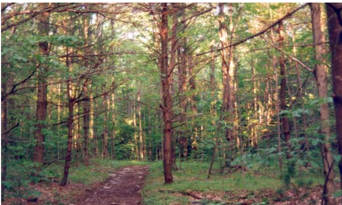
A trail on an ACLC Preserve

To reach the Phillipinkill preserve, from Delaware Ave. (Rte. 443), turn onto Fisher Blvd. (about .6 miles SW of Bethlehem Central High School). Take the second left into the Mansions at Delmar and immediately turn left; the entrance to the Preserve is at the edge of the woods, across the lawn from the parking area.