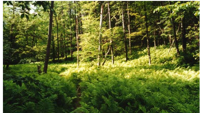
The Phillipinkill Preserve

At its December meeting the ACLC Board created a Greenway Committee to manage the three area preserves. A primary responsibility of this committee will be to play a leading role in developing a system of trails linking the Conservancy's preserves with nearby natural and recreation areas including the Five Rivers Environmental Center, the Pine Hollow Arboretum, the Elm Avenue Park and the EMT and Veterans Memorial Parks.