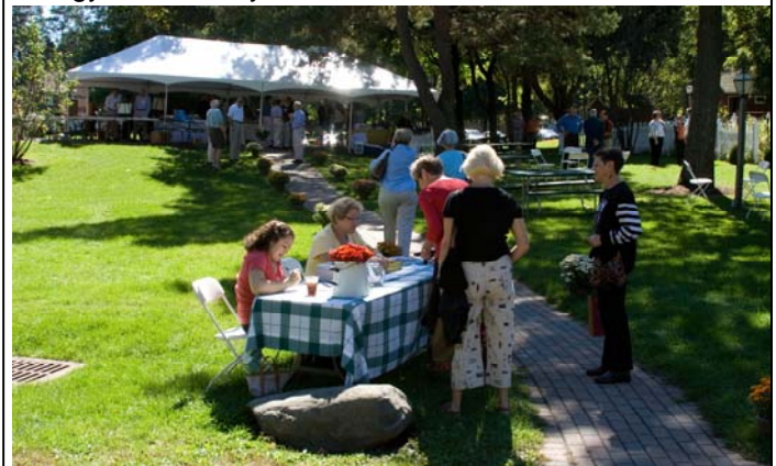
Guests arriving for the MHLC Gala on the beautiful grounds of the Pruy House

Our annual Gala is an important event to MHLC. It’s a chance for members to make new acquaintances, renew old ones, share experiences, and, importantly, make a major contribution to the Conservancy’s financial success. This year’s Gala, held on the grounds of the historic Pruy House in Latham, enjoyed wonderful weather and a beautiful setting. Record contributions and earnings from our silent auction made this Gala one of our most successful. Thank-you to all who contributed their time, energy, and money.