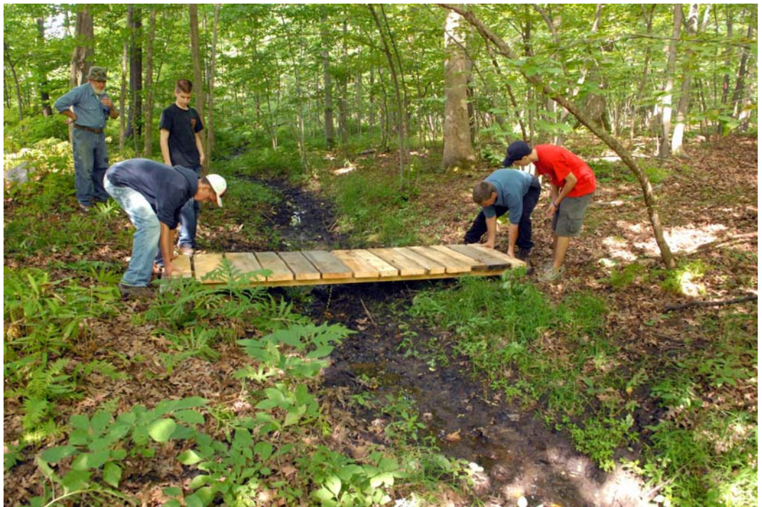
A bridge-building project nears completion at the Swift Preserve

Please watch for our year end appeal and give generously, or go online and make a year end donation at www.mohawkhudson.org . And I hope you will get out to enjoy our new trails!