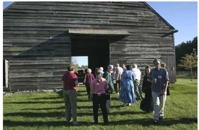
Arriving at the Wemp Barn for the Gala

The Fund Development Plan recognizes that the Conservancy's annual income must increase substantially over the next several years if we are to have permanent staff. The Plan therefore depends on an increase in our membership, an increase in revenues from the annual gala, a new annual fundraiser and a new campaign for operations.