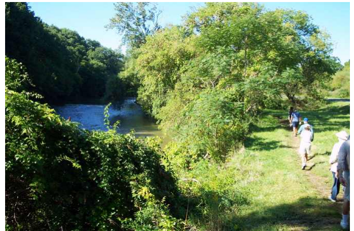
Outing across from our Normanskill Preserve

To let people see the new Normanskill Preserve (which is not yet open to the public) we held a joint outing with the Friends of Normanskill Farm. Their trail along the Albany side of the Normanskill allows you to see the full extent of our new Preserve. We will continue to work with Friends of Normanskill Farm and the City of Albany on joint projects, such as linking our trail systems.